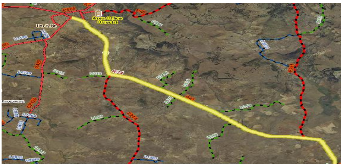
Figure C4.2 – Locality Plan of Main Road P420